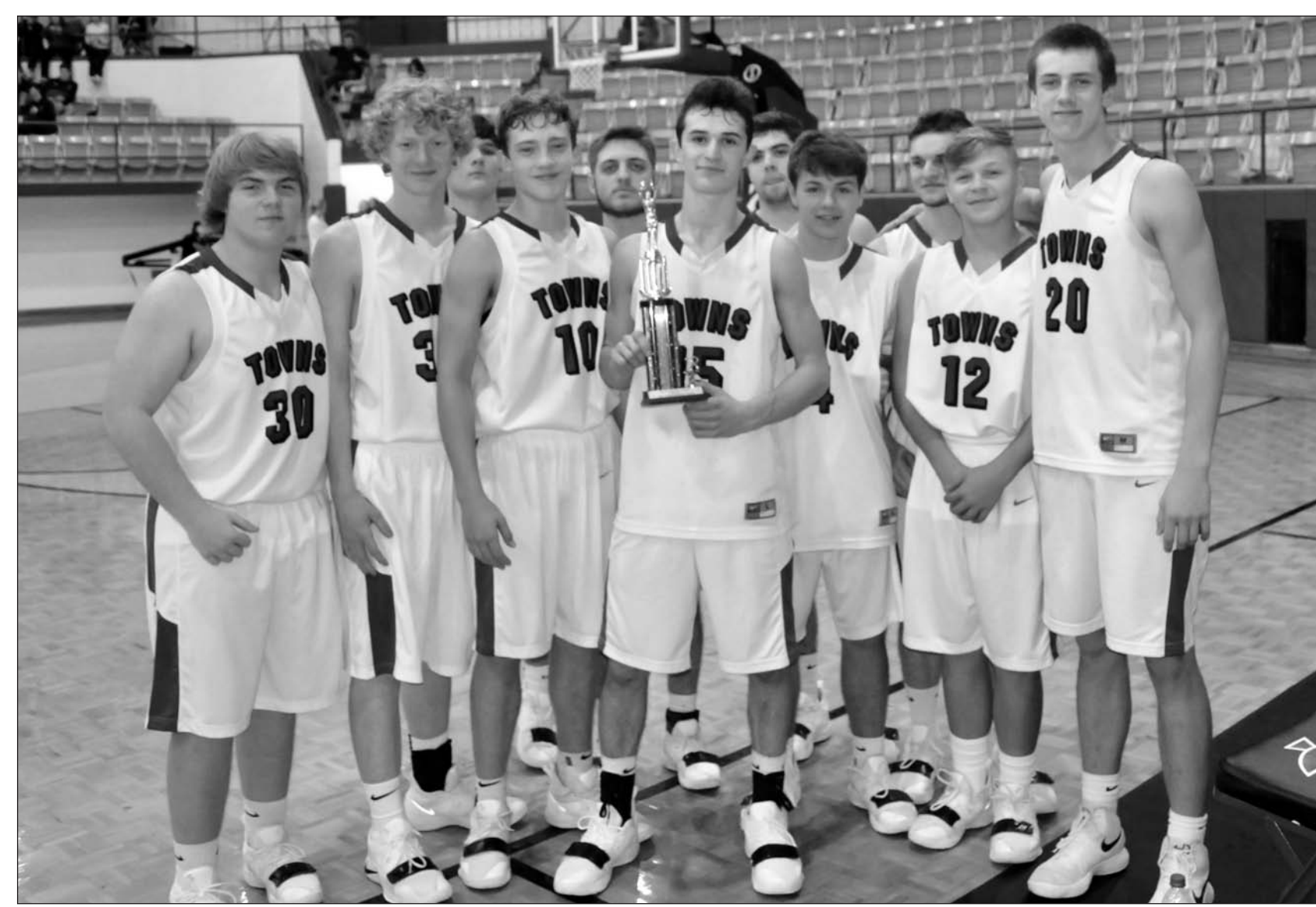
The Towns County Indians following their 88-77 win over Armuchee on day three of the Battle of the States Christmas Tournament.